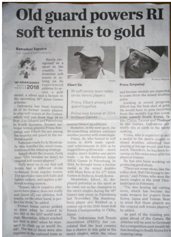
Figure 2. A Sample of Newspaper from The Jakarta Post to Analyzing the Structure of the News Writing