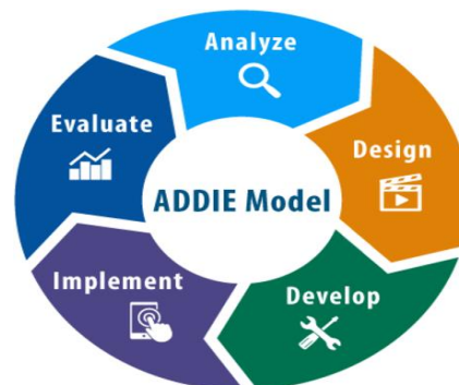
Figure 1. ADDIE Model

The type of research is development research (Research and Development or R&D). In this study, the authors used the ADDIE model. ADDIE model was chosen because it is a recommended development model in developing learning tools.