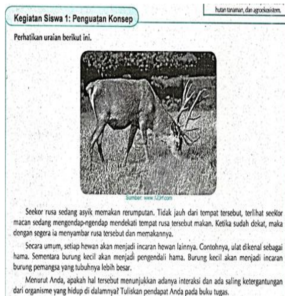
Figure 3. Aspects of predicting in book A and book B

The predicting aspect is also developed in both books. The presentation of the predictive aspect in the Biology textbooks analyzed is dominated by invitations for students to express an oddity that may occur in a situation that has not yet occurred. Predictive skills lead students in conveying conjectures about something that has not yet happened (Yuanita, 2018). This fits with the definition of predicting that predicting skills can make students understand the skills that students are asking to use design. The appearance of the predicting aspect in both books is found in the student activity section where students are led to predict something that will happen to another organism if there is an event such as the loss of one organism in the ecosystem.