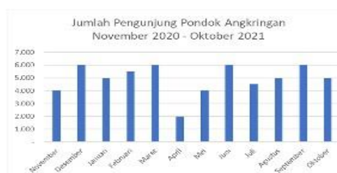
Figure 1 Data of Pondok Angkringan

The researchers were Kurniawati and Silitonga (2021) and Yucha and Safitri (2020). Meanwhile Andriani (2020) found that store atmosphere had no effect on purchasing decisions. Ma'Ruf Amin 2014 states that the atmosphere of the store is the atmosphere in the store that creates a certain feeling in the customer arising from the use of interior design elements such as lighting, sound system, air conditioning system, and service. Some researchers found that store atmosphere influences purchasing decisions. The researchers were Kurniawati and Silitonga (2021) and Yucha and Safitri (2020). Meanwhile Andriani (2020) found that store atmosphere had no effect on purchasing decisions. Some researchers found that store atmosphere influences purchasing decisions. The researchers were Kurniawati and Silitonga (2021) and Yucha and Safitri (2020). Meanwhile Andriani (2020) found that store atmosphere had no effect on purchasing decisions. Some researchers found that store atmosphere. The shift in lifestyle in the millennial era like today makes young people have a culture of gathering in certain places, such as cafes. Indonesians have a collectivism culture, so they prefer to gather with their community. coffee shop is one of the favorite places for young people to gather. One of coffee shop the choice of young people in Jember is Pondok Angkringan which is located in the middle of the UNEJ campus area.