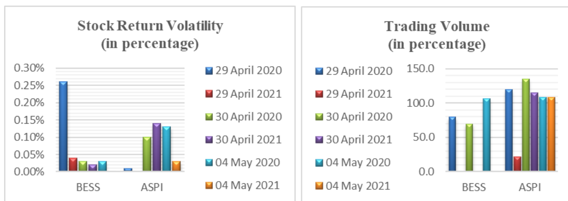
Figure 2 Indonesia Stock Exchange Statistic

Capital markets conduct at least two objectives: economic and financial functions. To carry out the function of both, the capital market persists to seek to attract the interest of companies that seek to get funding through the stock market. This is evidenced by the continued increase of companies that raise capital on the Indonesia Stock Exchange, starting from 55 companies (2018), 55 companies (2019), and 51 companies (2020) that record their shares on the Indonesia Stock Exchange.